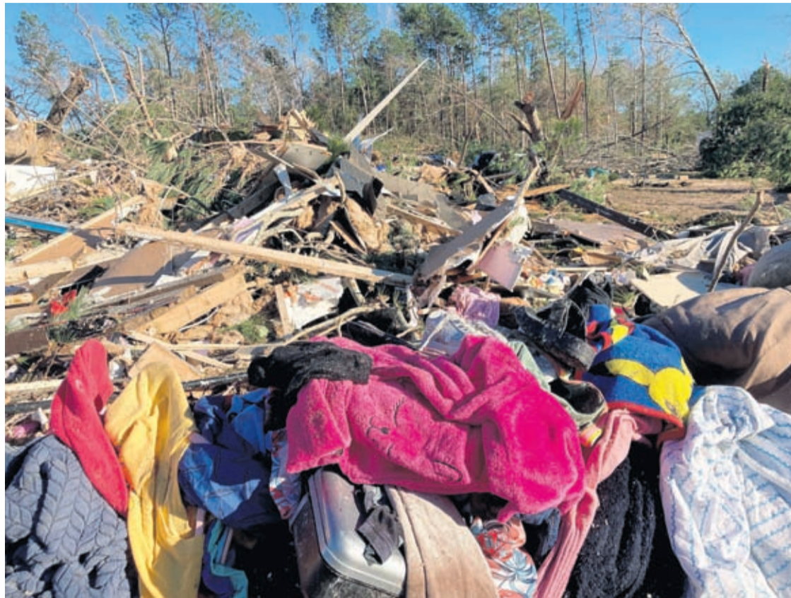
Debris is strewn about following severe weather Wednesday, Dec. 14, 2022, in Keithville, La.

The National Weather Service can take days to confirm whether destructive winds were in fact tornadoes. Data compiled by the Southern Regional Climate Center at Texas A&M University showed nearly 50 tornadoes reported across six states since Tuesday —